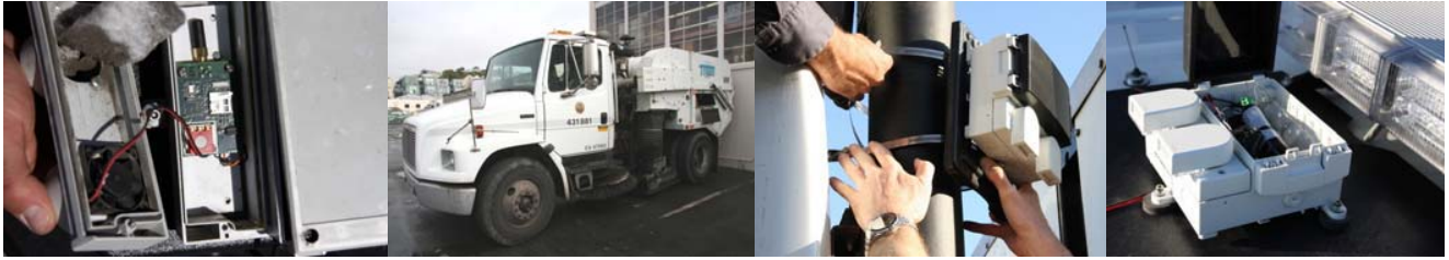
Figure 2. Variants of the sensing platform, enclosure-mounted on city street sweeping vehicles.

Francisco to put our air quality sensing systems on the municipal fleet of street sweepers. Street sweepers are vehicles that use mechanisms such as water sprays, brooms, and collection bins to clean debris from city streets (Figure 2). Our devices collect street-by-street air quality readings as the vehicles do their work, and the street sweepers have the key property that instrumenting a few vehicles provides both extensive and systematic coverage of the city.