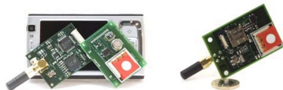
Figure 1. Split- and single-board sensor board designs.

In this trial, we are collaborating with the City of San