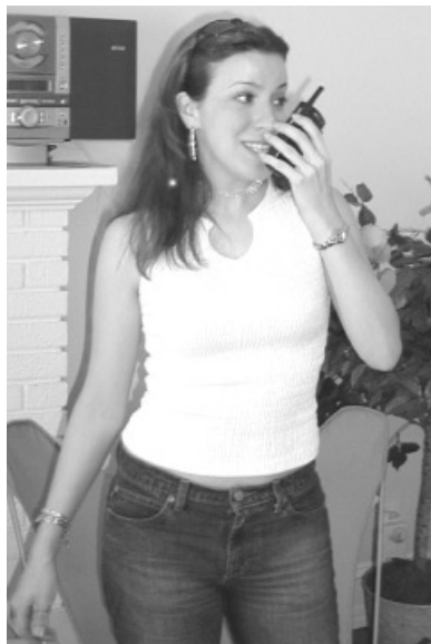
FIGURE 2: Speakerphone method of PTT mobile radio use.

users, the radios reset and speakers must use the phonebook menu to select a new addressee. Unlike conventional radio, the mobile radio system technologically ensures that only one user speaks at a time. 5 If B attempts to initiate a connection while A is transmitting, B will receive a “busy” signal until the channel is clear.