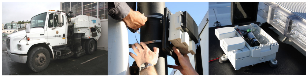
Figure 2. Enclosure-mounting the sensor package on city street sweeping vehicles.

the environmental decision-making process – generally remains beyond the scope of art projects. As has been recently noted, this risks making community members highly aware of problems without making it equally clear how to address them [8].