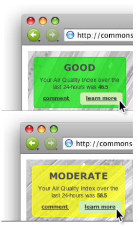
Fig. 3. Two views of the My Exposure application

The first application provides a widget that helps users answer one of the most common questions we observed in our fieldwork: "What is my exposure to a pollutant?" Many of the community members we interviewed suffered from allergies or respiratory disease exacerbated by the poor air quality in their neighborhood, and expressed a desire for tools that would help them gauge and mitigate their exposure. To meet this need, we developed the My Exposure widget (Figure 3, Figure 4a). My Exposure shows a single