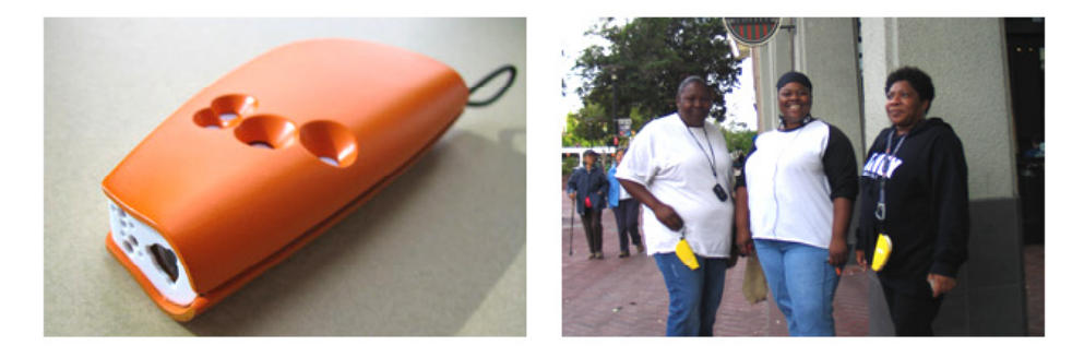
Fig. 1. A personal air quality sensor (left). Community members with sensors (right).

systems may be able to detect the presence of a pollution source, local insight may be required to actually identify the source or reveal sensitive populations affected by it.