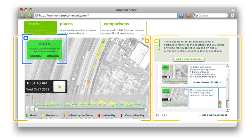
Fig. 4. The Common Sense Community Site showing data collected by a single user. The My Exposure widget (a) and Tracks visualization (b) are visible along with the commenting panel (c).

visits. To encourage participants who are initially only curious about their exposure to further explore their data, we placed the My Exposure view adjacent to the Tracks application (discussed momentarily).