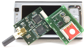
Figure 1. Sensor board design.

the environmental decision-making process – generally remains beyond the scope of art projects. As has been recently noted, this risks making community members highly aware of problems without making it equally clear how to address them [8].